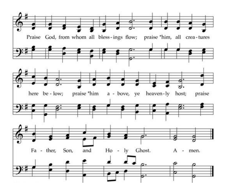
*Prayer of Dedication and Thanksgiving